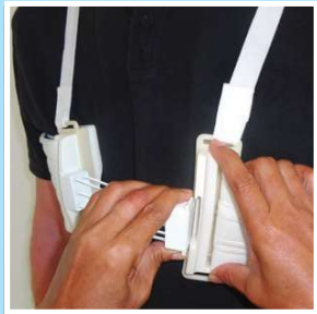
Click on the pulley