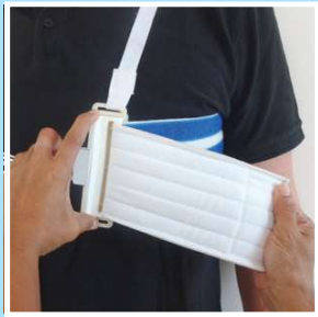
Adjust the velcro band